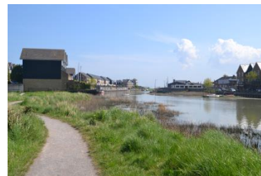
V3 From Crab Island towards the oil depot and Oyster Bay House