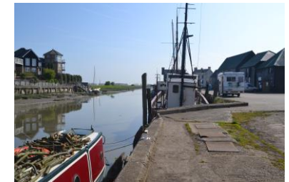
V5 From the Abbey Road end of Standard Quay along the quay and towards the sea wall at Ham Marsh