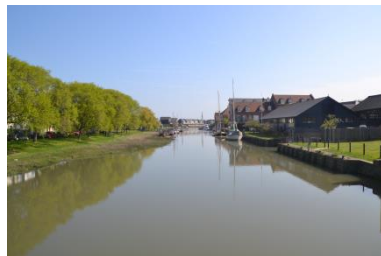
V2 From the creek bridge down the creek towards Waterside Close