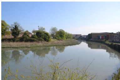
V1 The basin from the walkway outside Morrison's