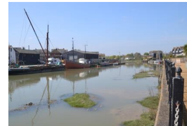
V4 From Waterside up the creek towards the town